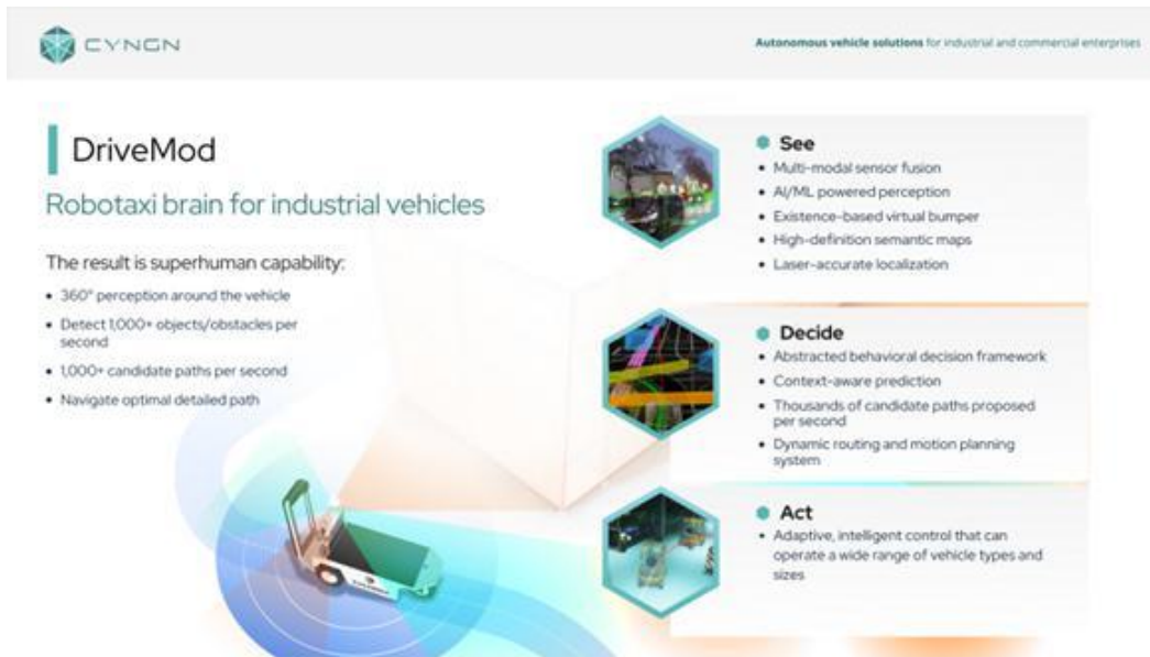
Figure 1: Overview of Cyngn's autonomous vehicle technology (DriveMod)

DriveMod's flexibility combines with our network of manufacturing and service partners to support customers at different stages of autonomous technology integration. This allows customers to grow the complexity and scope of their industrial autonomy deployments as their business transforms while continually capturing returns throughout their transition to full autonomy. EAS will also grant customers access to over-the-air software upgrades, ad hoc customer support, and flexible consumption based on usage and scale of operations. By lessening both the commercial and technical burdens of traditional vehicle automation and industrial robotics investments, industrial AVs can become universally available to the market, even reaching small and medium-sized businesses that may otherwise struggle to adopt Industry 4.0 and 5.0 technology.